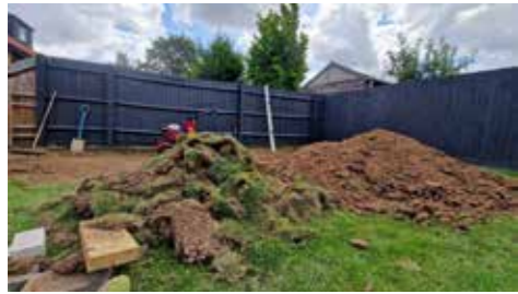
4. Site photos : End Result