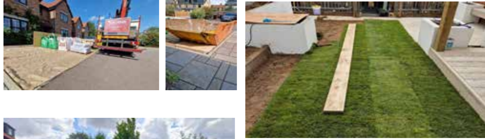
3. Site photos : during construction

Actual Cost :£24,680 following upgrade to Millboard Decking and including plants and a pc sum for lights (for later installation)